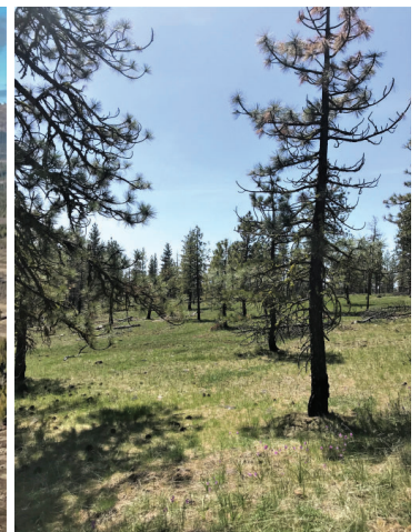
Left: EKCD's recent land purchase will protect 2,280 acres of forest and rangeland from subdivision and development. Right: Pine forest located within EKCD's recent land purchase in the Simcoe Mountains, north of Goldendale.